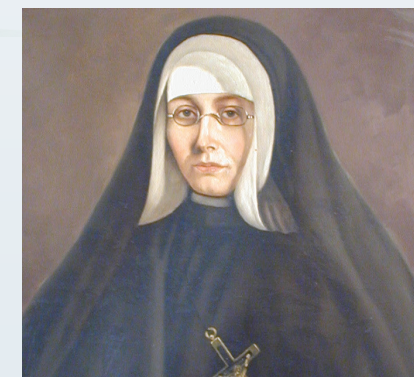
MARIE-ROSE CENTRE Longueuil

The Cocathedral, with its Gothic Revival architecture and Neo-Byzantine dome, was inaugurated in 1887 and is listed as a heritage building. The museum houses objects dating back to the origins of the parish in 1697. The cocathedral's value as a heritage building and its unique character put it among the top-rated buildings in Quebec. Also temporary exhibition and cultural activities.