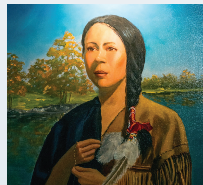
SAINT KATERI TEKAKWITHA SHRINE Kahnawake

Jesuit Mission of the 18 th century located in the Mohawk community of Kahnawake. Built in 1720 in the old Fort St. Louis, the mission exhibits historical, cultural and archaeological treasures, including the tomb of Saint Kateri Tekakwitha, a young Native American, canonized on October 21, 2012. Located in front of the church, the Interpretation Center is open on specific terms and schedule.