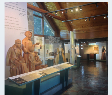
SANCTUARY OF SAINT MARGUERITE D'YOUVILLE Varennes

Founded in 1667, Boucherville is one of the oldest cities in Québec, and the Church Square, is the historic heart of the city. Built in stone, the church, flanked by the former convent on the right and the former presbytery on the left, dominates the place. In addition to the beauty of the church, which features a high altar considered one of the masterpieces of Quebec's ancient sculpture, a museum of sacred art has recently been built. Numerous artifacts and objects of interest.