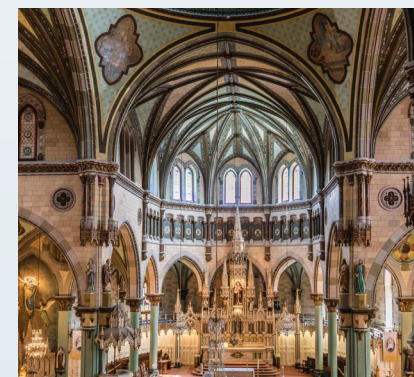
COCATHEDRAL OF SAINT-ANTOINE-DE-PADOUE Longueuil

Jesuit Mission of the 18 th century located in the Mohawk community of Kahnawake. Built in 1720 in the old Fort St. Louis, the mission exhibits historical, cultural and archaeological treasures, including the tomb of Saint Kateri Tekakwitha, a young Native American, canonized on October 21, 2012. Located in front of the church, the Interpretation Center is open on specific terms and schedule.