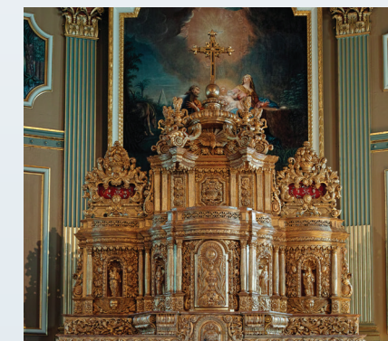
SAINTE-FAMILLE CHURCH Boucherville

Explore the world of the Sisters of the Holy Names of Jesus and Mary (SNJM), the first woman teaching order founded by a Canadian, Blessed Marie-Rose Durocher. On this classified heritage site, discover the Foundation House, the convent, the chapel, the museum, the exhibition room and the historic rooms where Marie-Rose lived. A 5-minute walk will take you to her tomb in the chapel dedicated to her in the Co-cathedral.